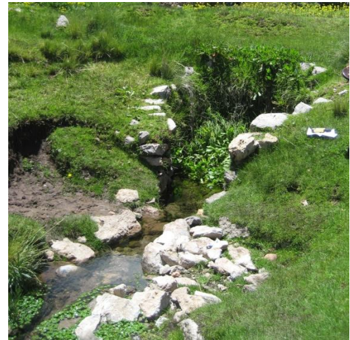
Figure 2: Parina community spring containing high concentrations of E.coli and fecal coliforms