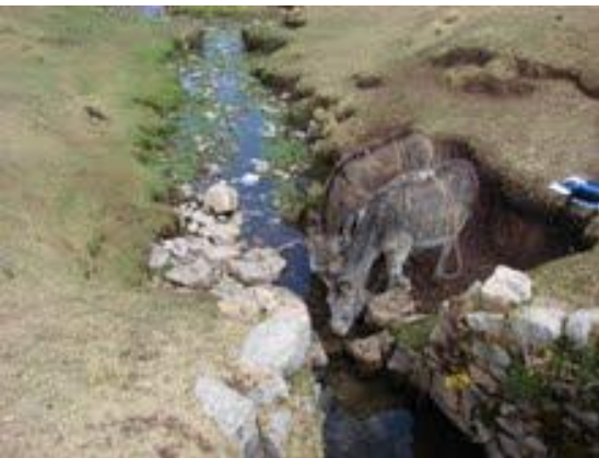
Figure 1: Community spring in Parina where community members get drinking water

The community of Parina primarily obtains their drinking water from unprotected springs contaminated by human and animal waste and unmaintained wells built by the government. The primary spring is a location in which the community obtains drinking and cooking water and takes their animals to drink (Figures 1 & 2). While water from this spring is initially pure and potable, environmental contamination and lack of maintenance leads to unclean drinking water in the spring. The structure of this spring is not ideal for preventing contamination of ground water and perpetuates water-related diseases. A local Peruvian non-governmental organization, Suma Marka, along with two dedicated community members have been conducting monthly water quality monitoring tests on the spring water since January 2010 and have consistently found bacterial contamination in the water. The spring has been seen to contain higher than normal levels of Escherichia coli and fecal coliforms. The presence of these indicator microbes increases the likelihood of gastrointestinal problems and diarrhea in Parina, especially among vulnerable children, pregnant women, and the elderly. Therefore, the construction of an improved community spring with a catchment box is needed to prevent further contamination of the spring and provide clean drinking water to Parina community.